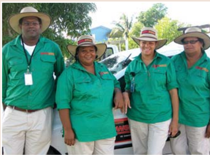
Powersavvy field officers in QLD