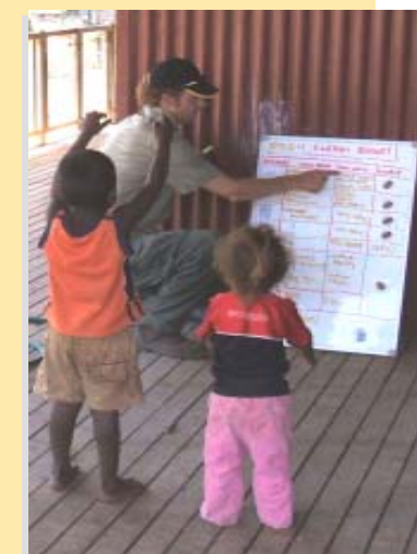
Lingarra kids join in the energy planning process

Even though the implementation of these solutions are yet to be completed, the basic training undertaken to date has already seen a drop in energy costs for residents, who are spending less on their fuel cards.