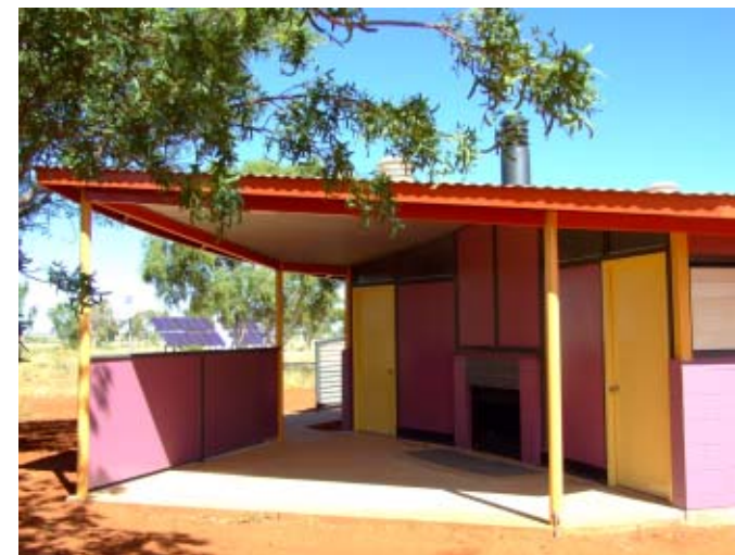
The new dormitory at Mt Theo

The Mt Theo Program is the primary organisation responsible for addressing substance misuse in the Warlpiri region. In 1994, as a community response to crisis levels of sniffing in Yuendumu, Mt Theo Outstation was opened. The Program is now recognized nationally and internationally as providing an effective and innovative response to substance misuse. (from http://www.mttheo.org/home.htm )